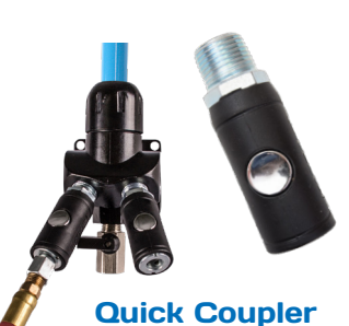
K7241 1/2" Male NPT Thread